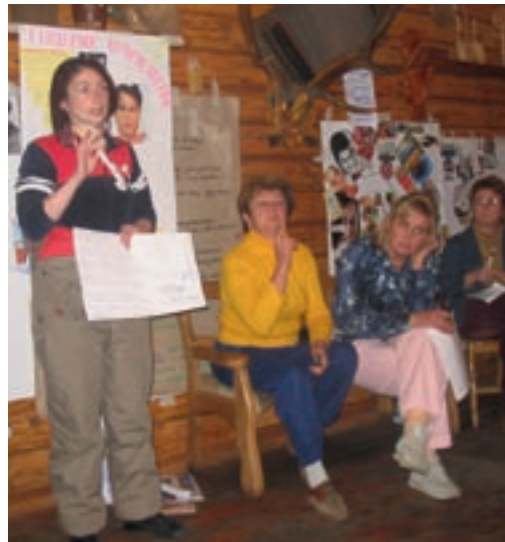
Workshop on the influence of women's NGOs

actors, singers, and television presenters, the parties hoped to achieve more popularity—but that has very little to do with a recognition of women as equal political partners."