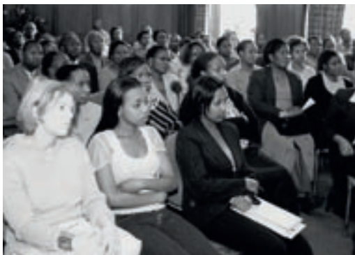
Gender forum on July 25, 2006, in Nairobi

The commitment shown by many organizations bore only limited fruit in the 2007 elections: fifteen women were elected to parliament (out of a total of 210 elected representatives). A further six were nominated by the parties (out of a total of twelve nominations), so that the proportion of women in the Kenyan Parliament is now 9.5%.