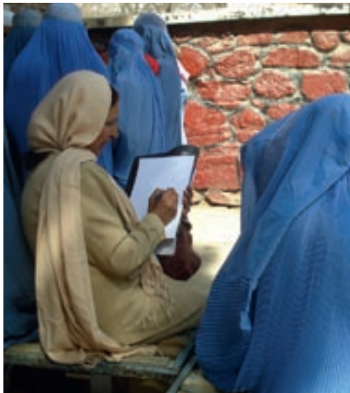
WCLRF survey in a hospital

ative use of a range of media formats—radio drama, folksongs, films—to disseminate information and campaign for change. The bi-monthly legal and information magazine Waqayat (Reality) is popular, because it offers an attractive mixture of feminist and “housewifely” topics.