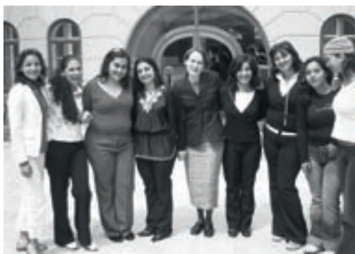
Political participation by Roma women

In the context of the "Decade of Roma Inclusion" (2005–2015), the Heinrich Böll Foundation's Prague office has supported a training course to prepare nine women for work in various areas of politics. The course was designed and assisted by two Roma organizations: Athinganoi and Manushe, the women's organization of the NGO "Slovo 21."