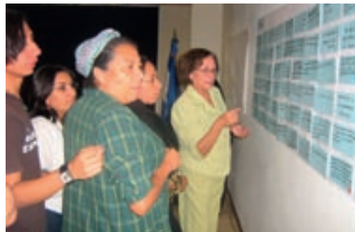
Workshop on gender equality in the judicial system