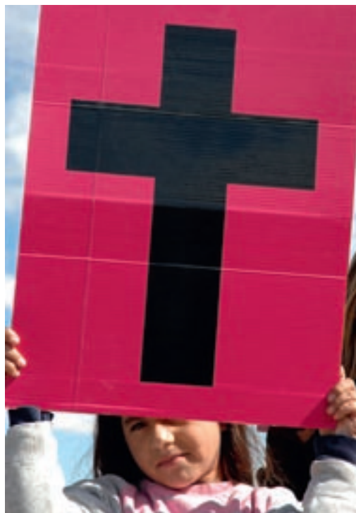
Scene from the film Bajo Juárez

The authorities of the city and the province reacted to the murders with an aggressive form of indifference. They did barely anything to solve them, but plenty to impede investigations. That has led many people to believe that the authorities are protecting the perpetrators. The police—not interested, but feeling the public pressure—kept offering up “perpetrators.” Some of these had been treated so badly in police custody that they had signed “confessions.” Family members have been ignored or laughed at; representatives of civil rights organizations branded as unpatriotic; the lawyers of suspects subjected to intimidation, harassment, and persecution. Above all, though, the murders carried on after each arrest.