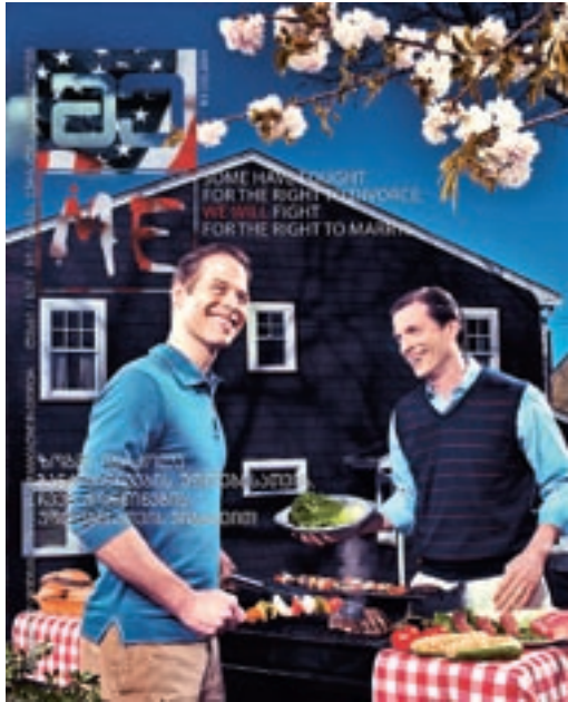
Me—Georgia's first LGBT magazine