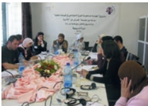
Gender conference with MIFTAH and the Heinrich Böll Foundation

cal situation meant that it was not even possible to present the model.