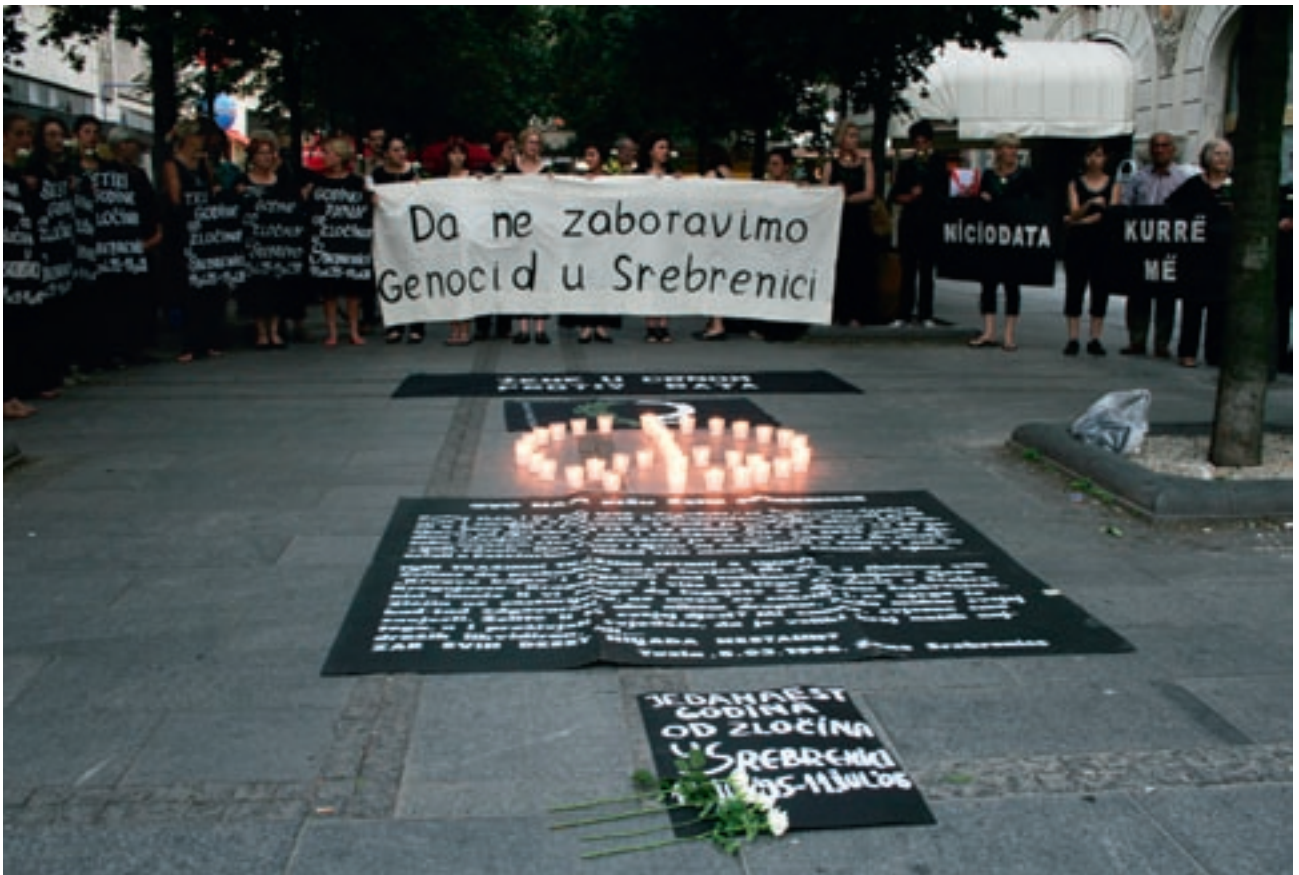
Demonstration by the Women in Black

feminist initiatives in the other countries of Southeastern Europe, the group has for many years acted as a bridge across the former frontlines.