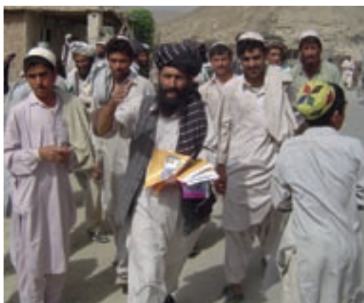
Political education on elections

Step by step, the Heinrich Böll Foundation is trying to increase the profile of gender components in TLO's work. Great tact is needed, however: tribal elders are only prepared to allow this to a limited extent. Innovations are welcome only as long as they do not restrict or undermine the power of the village elders. In the villages, too, participation by women is only possible when the issue affects them directly. In this context, promoting women's interests too outspokenly could result in the reverse of the intended effect, with women's rights coming to be regarded not as a universal value that is positive for Afghanistan like everywhere else, but as a contemptible Western construction.