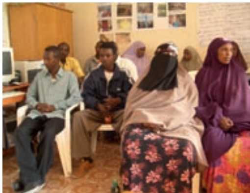
Neighborhood committee organized by NAGAAD

this conference was designed to decide upon who should become the president and the Members of Parliament. Finally, fifteen women were allowed to listen—and had to hear that no seats and votes in the parliament or in the government could go to women, simply because those positions would be filled on the basis of clan representation. But which clan does a woman represent: that of her origin, or that of her husband?