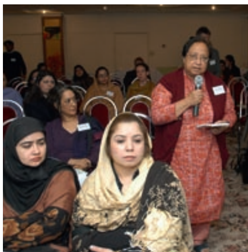
Islamabad, 2007: Pakistani/Afghan/Iranian dialogue between women

In the World Economic Forum’s 2008 Gender Gap Index, Pakistan does badly, in 127th place out of 130 countries. Only in the case of political participation do things look considerably better, because the country has been governed by a woman for periods of time and because a relatively high number of women sit in parliament: 76 of the 338 delegates are women. That is due to a quota system setting down that there must be 17% women on the national level and in the provinces, 33% on the regional level.