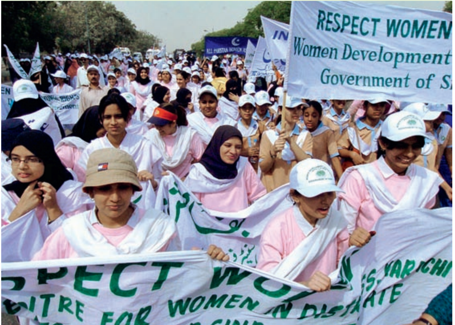
International Women's Day in Karachi: Pakistani students demonstrate against violence against women