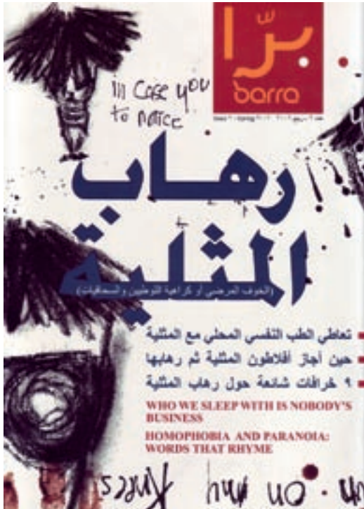
Barra magazine's special issue on homophobia

appeared. Its varied contributions carried the clear message that it is not the homosexuals who are the problem, but the society that refuses them their fundamental rights. In 2009, the Foundation co-funded another publication, Myths on Homosexuality , which appeared not only in English and Arabic but, for the first time, also in Armenian, so as to reach Lebanon's Armenian minority. February 23, 2009, saw another milestone: the first sit-in against violence against minorities, held on Sodeco Square. For the 200 participants, it was a moment to celebrate when they held their banners high: "We shall no longer be afraid."