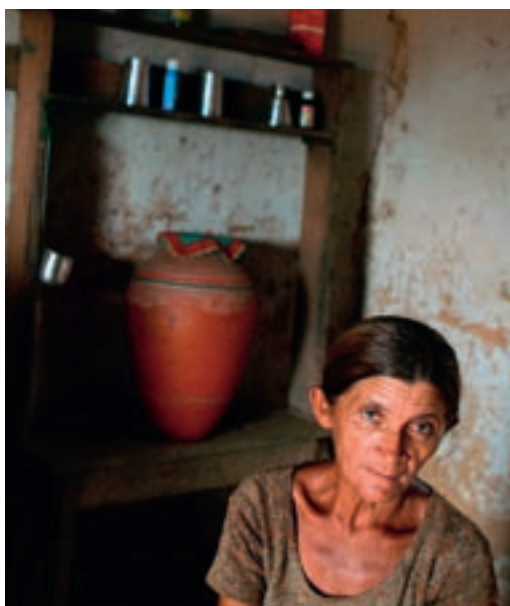
Campos Lindos: peasant farmer facing expropriation – soya is to be cultivated on her land.

Large-scale monoculture farming is a threat not only to Brazil's last remaining ecosystems, but also to peasant farmers and traditional communities. The promised land reform moves ahead at a snail's pace, while agribusiness expands and is rapidly changing the model of agricultural production. The introduction of genetically modified seed, in particular, means smallholders become increasingly dependent on the big agricultural corporations.