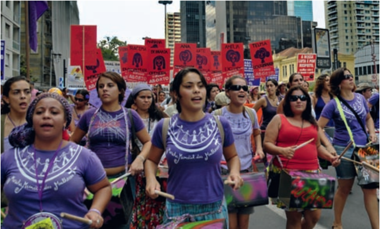
Protests against the criminalization of women who have had abortions

Every woman should be able to decide autonomously how and with whom she wants to live, based solely on respect for diversity and individual differences. That too is a way for commitment to grow.