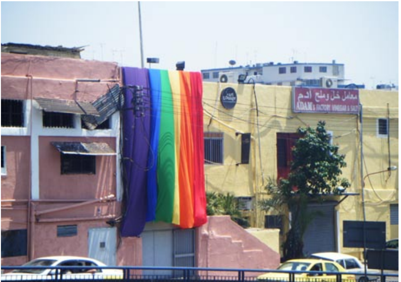
Beginnings of tolerance in Lebanon