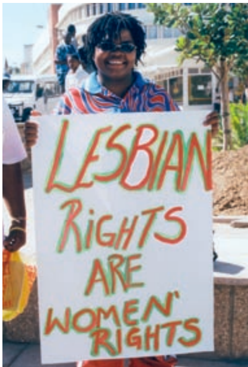
(above) Demonstrators supporting the equality law, March 2002 (below) Demonstrators supporting equal rights for lesbians

Sister Namibia tirelessly faces up to the problems of the country, disseminates information about HIV/AIDS, and denounces endemic violence against women. The magazine also acts as a vehicle for campaigns, whether for adequate political participation ("50/50") or, most recently, for the right to sexual autonomy and choice ("50/50 in the bedroom!"), a feminist response to HIV/AIDS and sexual violence. Trying to explain the high propensity for violence in Namibia, Liz Frank refers to the still-raw trauma of the independence war, the failure of reconciliation, and disappointed expectations placed in the independence process: "Taking violent 'possession' of women gives these men a feeling of power and control."