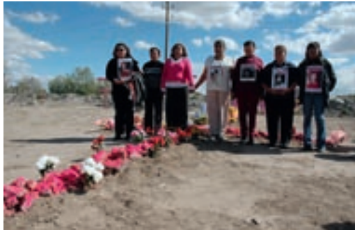
Scene from the film Bajo Juárez

The murders in Ciudad Juárez have a range of different backgrounds. By no means all of them are part of a single grisly series; some have been solved. But it is also certain that some of the women were held captive for several days and subjected to sexual torture before they were killed. Feminists have coined the term “femicide” for such murders perpetrated solely on the grounds of the victim’s gender. The feminicides, as a serial crime, are most obvious in Juárez, but they also occur in other countries, especially those of Central America. As the extreme end of a long continuum of violence against women, the events provoke interest beyond the region, and the Heinrich Böll Foundation’s European Union office has made femicide one of the focal points of its global dialogue program.