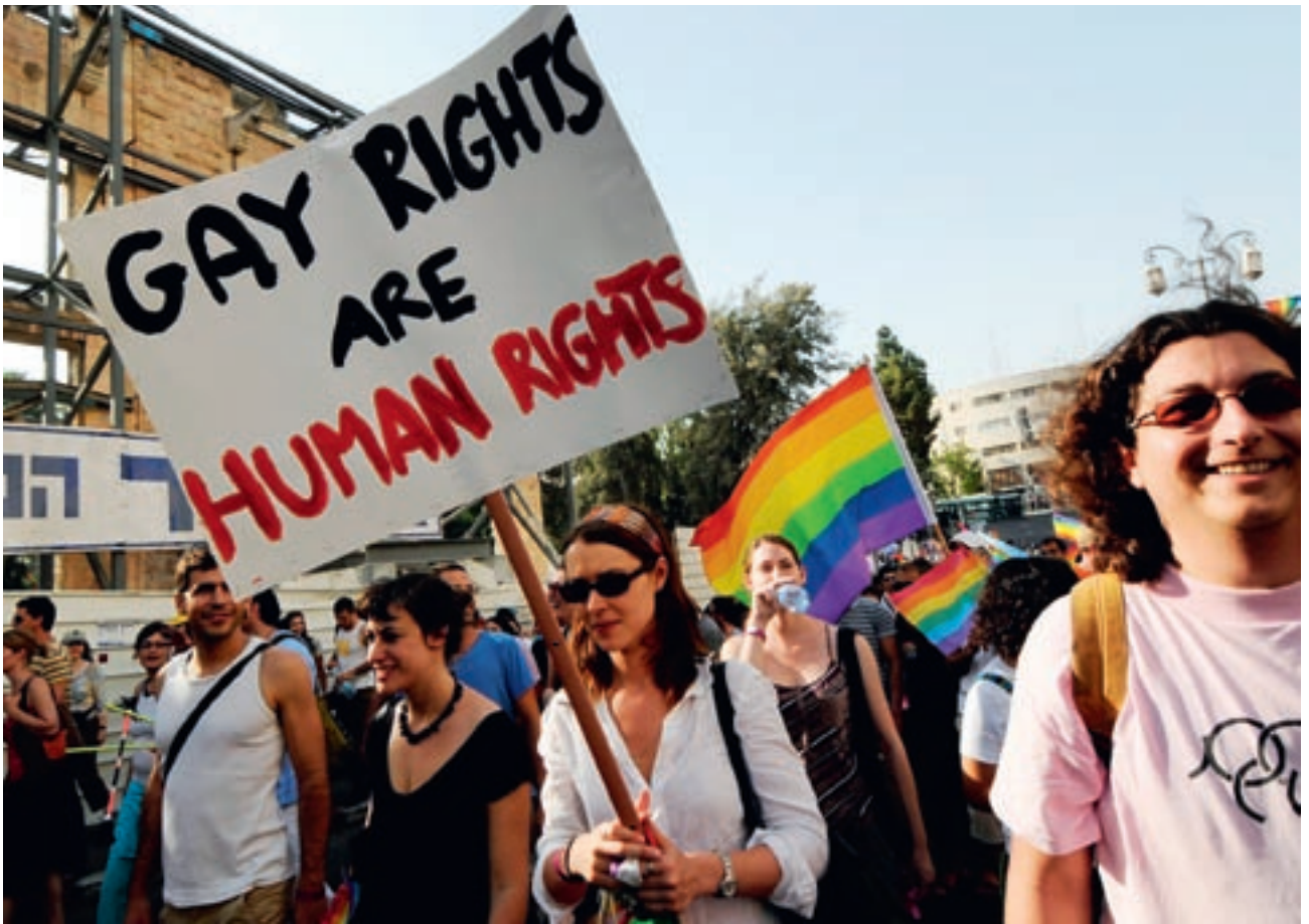
Jerusalem, June 26, 2008: Gay Pride parade with over 3,000 participants and heavy police protection