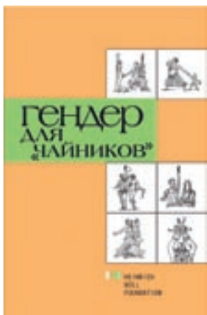
"Gender for Chainiki" booklet

In Russian, the term "gendernaya demokratiya," or gender democracy, does not create a warm feeling, not even for its few proponents. It sounds technical, alien, inaccessible. Up to now, books and texts on the theme have been written by a small circle of experts for a small circle of readers. It's hardly surprising that the influence of the ten Russian gender centers on public debate has been minimal—even within the narrower field of the NGOs, let alone in society as a whole.