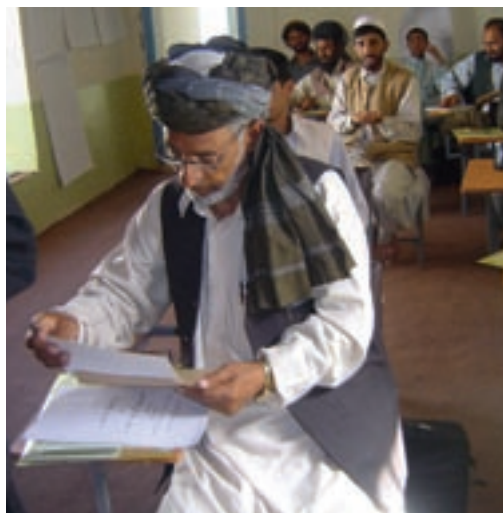
Pashtun tribal chief

It was a leap into the dark for us to collaborate with actors whose values have so little in common with our own fundamental interests. Yet it was precisely for this reason that we thought it so important to gain access to these parts of society. Because of the profound influence such groups have on Afghan society, transformation can only be achieved with them, not against them. We were perfectly well-aware that it would be a tightrope act, and arranged in advance to have intensive professional support during our cooperation with TLO.