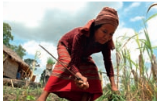
Cambodian women working on the land

On the formal level, gender mainstreaming seems to have left its mark on Cambodia's government: the national strategic development plan and other government plans mention the significance of gender, the Department for Women has passed a second five-year plan, and many other departments have gender mainstreaming "action groups." Nevertheless, a wider political understanding is still absent in many cases. Most of the gender representatives at the local level content themselves with collecting health and hygiene statistics and working on improvements to sanitary facilities.