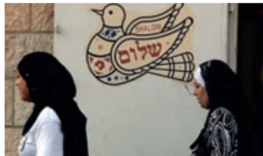
Dove of peace in Acre, northern Israel

The change this amendment could potentially achieve was outlined by the members of Itach ("We with you") in the form of questions: "What would the world be like if women led peace talks and resolved conflicts between nations with opposing interests? And if they were the ones to make decisions about life after a national trauma? How would the socio-economic rifts between the various groups in Israeli society be addressed if women from all social groups were invited to draw up models for the best possible policies? What would change in the relationships between Israel's different groups if Jewish, Muslim, and Christian women worked together on decisions for the country as a whole?"