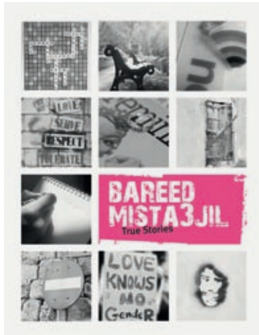
Lesbians and queer women write about their lives

Helem's main objective is to abolish Article 534 of the Lebanese Penal Code, which penalizes "unnatural sexual intercourse." To gain more momentum and legitimacy for this goal, it is consciously seeking out alliances with other Lebanese civil society organizations, which are only accepting the topic with some reluctance. Helem works toward other social-policy objectives as well: in 2003 the organization took part in the movement of opposition to the Iraq War, and in 2006 it coordinated emergency assistance for refugees from the south, many of whom support Hezbollah. The crisis situation created points of contact that would otherwise have been unlikely to arise.