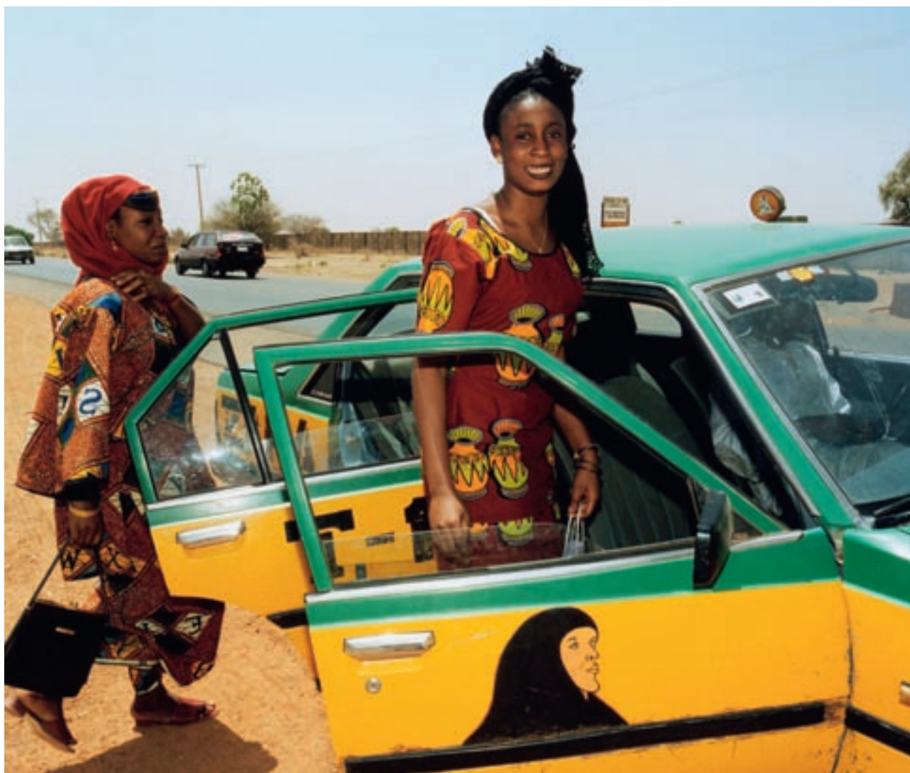
Women are not allowed to ride in a taxi with strange men