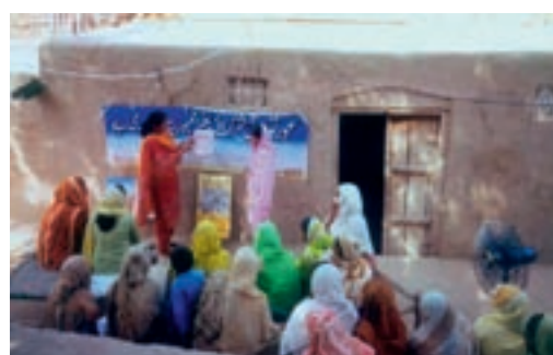
Aurat Foundation educational events

The Aurat Foundation, one of Pakistan’s oldest and most respected women’s organizations, has a presence in all 110 districts of the country. It played a key part in the introduction of the quota for the 2001/2002 elections. Since then, Aurat has used its considerable energy and strategic skill to try and turn the 33% quota into genuinely effective participation by women. The obstacles are immense: in many areas women are not even allowed to leave the house and do not have the identity cards necessary to vote or run for office. In the end, 70,000 women ran for office, and 36,105 were elected. The Aurat Foundation helped many of those women to fill in the required paperwork, giving them information on fundamental rights and duties. The scale of the resistance they faced became clear in the by-elections of 2004: of the 4,869 reserved seats, only 2,866 could be filled.