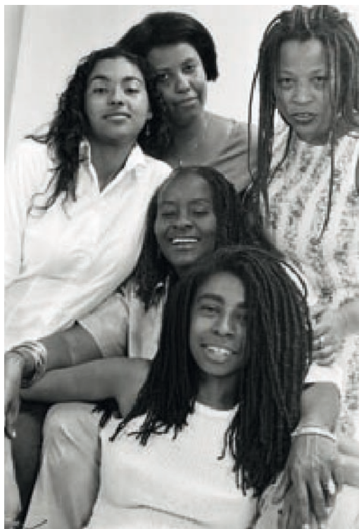
The CRIOLA team

away from racism, sexism, and homophobia – and to foster a society of justice, fairness, and solidarity that regards black women’s contribution as a benefit for the community. CRIOLA activities have reached more than 5,000 women, say the group’s members with justified pride.