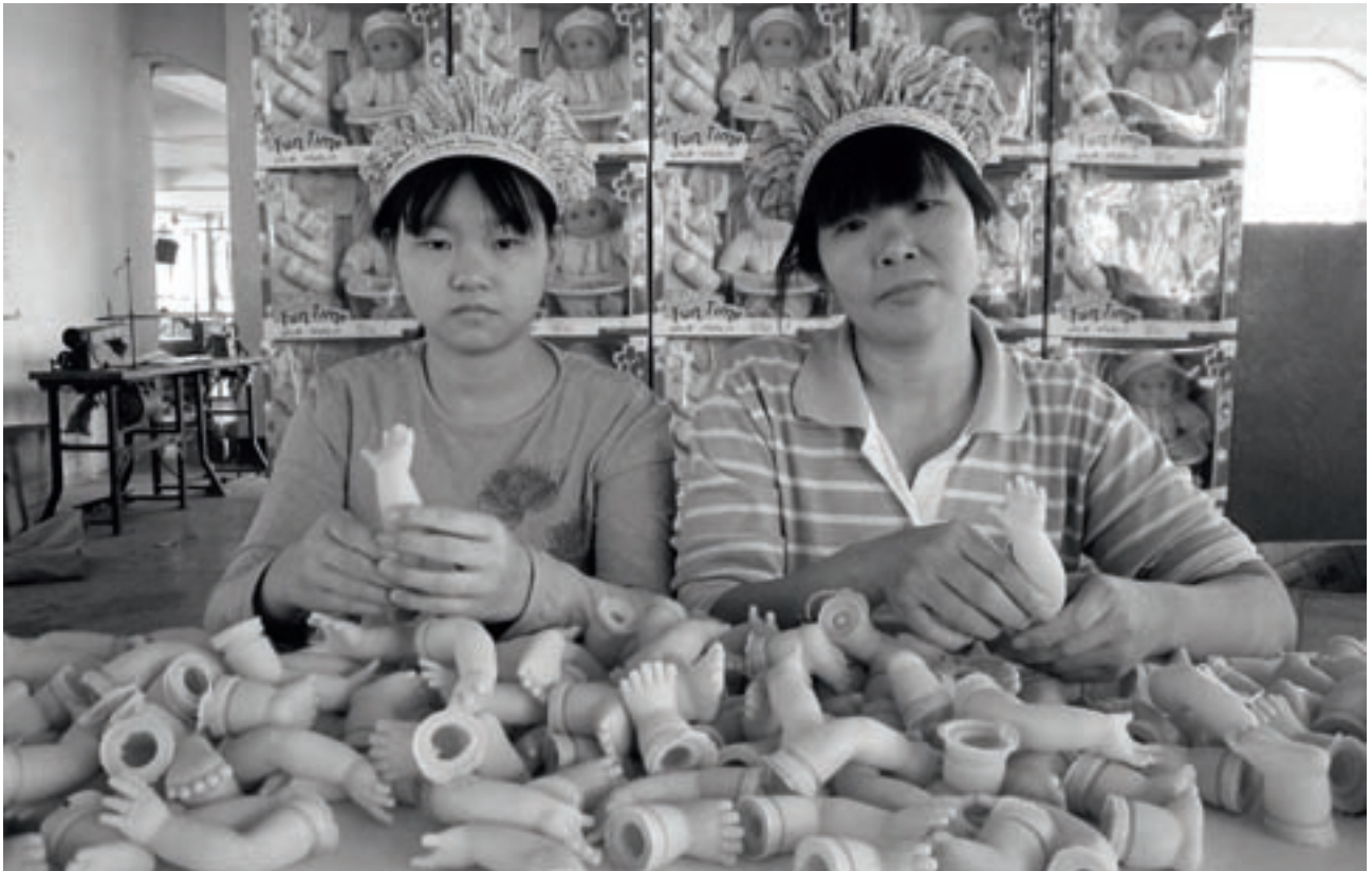
Chinese workers in a Guangdong toy factory

cial protection? What role is played by the provision of care for children and the elderly? What differences exist between women from urban and rural regions? These questions, along with others normally excluded from the curriculum of the economic science faculty, were to be investigated in the two research studies.