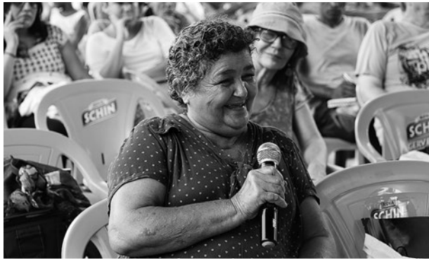
Conference on the financialization of nature in Belém, Brazil: community representatives from Quilombolola do Rio Capim report on local problems, such as those caused by the large-scale production of palm oil.