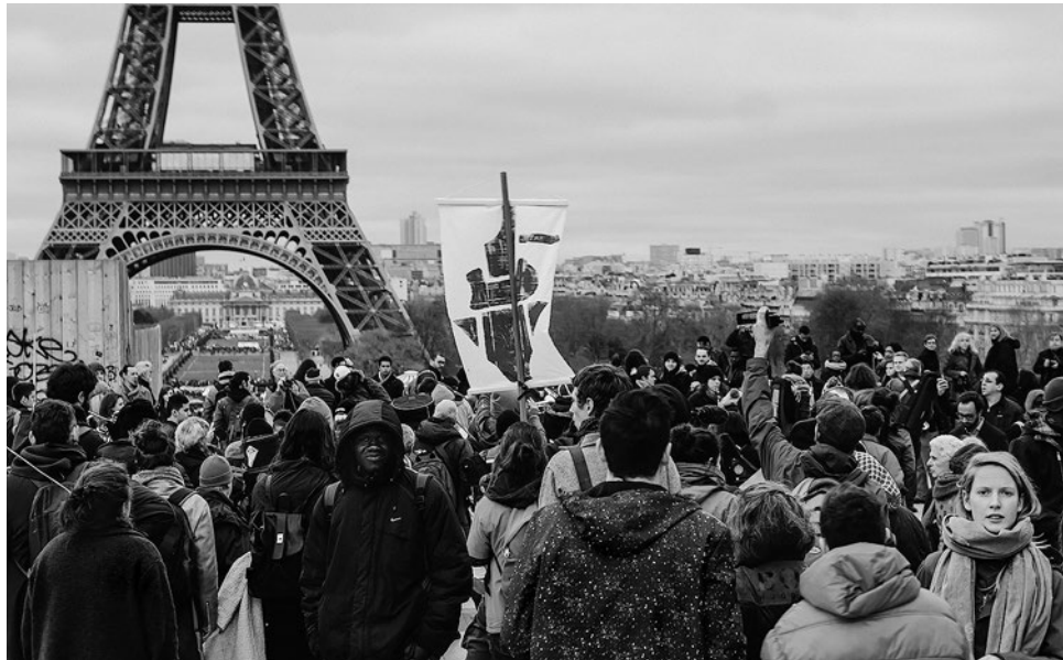
Climate summit in Paris: People from around the world staged creative protests to call for climate justice

The Heinrich Böll Foundation wants to accelerate the transition to a low-carbon, resource-efficient, and equitable global society – this means moving away from the predatory exploitation of natural resources and moving towards greater cooperation with nature. We are actively committed to the conclusion of a global climate accord under the auspices of the United Nations. Furthermore, those stakeholders whose business models make climate change worse must be called on to pay. One of our top priorities is to promote alternatives: the green energy revolution, environment-friendly agriculture, and sustainable urban development. It's within our power to achieve a turnaround in global climate policy! We support social and environmental transformation everywhere – here at home in Germany, and around the world wherever our international offices are located. We fight for drastic reductions in resource consumption, for transparent contracts in the commodities industry, and for accountability on the part of mining companies. We want to find solutions that enable natural resources to be used in a way that respects the ecological limits of our planet while simultaneously strengthening human rights and democracy.