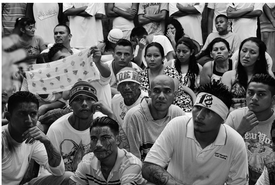
Young gang members imprisoned in Quezaltepeque, El Salvador

themselves have to take on tasks that should be performed by the state, often risking their own safety in the process. For this reason, activists in Mexico are calling for a general law on disappearances that provides for searches, investigations, and compensation in line with international standards. At a panel discussion in Berlin co-hosted by the Foundation and the German Coordination for Human Rights in Mexico, we honored the memory of the disappeared students and discussed ways to combat these types of crimes. Often the only support for families of missing persons comes from human rights organizations such as the Tlachinollan Human Rights Center and the Centro Pro Derechos Humanos , both long-time partner organizations of the Foundation.