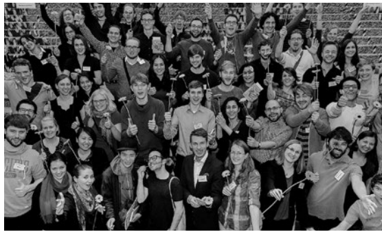
"Green promotion of gifted students makes a difference" – This was our slogan to celebrate the Scholarship Program's 25th anniversary. Our new fellows for 2015 joined the festivities.

We provide support to undergraduate, graduate, and doctoral students from both Germany and abroad, in all fields of study. Our aim is to discover promising talent and to enhance its potential. In this way, we hope to encourage young people to become globally engaged in the pursuit of the Foundation's objectives: more democracy, solidarity, environmental action, sustainable policies, and human rights.