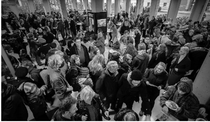
Every year following the annual demonstration Wir haben es satt! ("We're fed up with the agro industry!"), organized by the Meine Landwirtschaft ("My agriculture") alliance, the Heinrich Böll Foundation serves as a central meeting point for thousands of marchers as they continue their discussions over a warm bowl of soup.

office in Santiago de Chile supports Modatima's grassroots work and helps water rights activists to forge stronger networks that can boost the effectiveness of local resistance efforts. To help protect water rights activists from further attacks, our office is boosting their (inter)national visibility by providing media outreach and regular coverage on its website. We are also providing support to lawyers who are willing to litigate cases that have the potential to achieve a broader impact on the inter-American and international human rights system above and beyond the individual case.