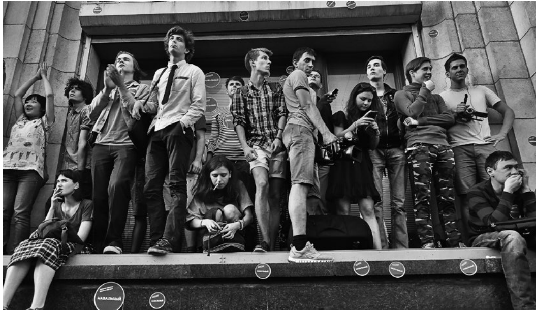
Young Moscovites at an opposition rally