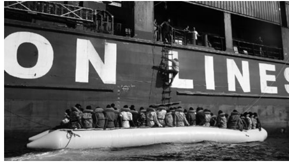
The crew of the Sea-Watch helps a boat full of exhausted people to board a freighter. Over 100 refugees were rescued in the operation. In an online logbook published on www.boell.de, two of the ship's crew members reported on the dramatic situation in the waters of the Mediterranean Sea.

they ease access to the EU only for those who already have it anyway, namely business and political elites. In return, the EU is able to use local security structures – which are not subject to democratic control – for purposes such as reinforcing borders with other transit countries. Moreover, supplementary agreements would provide individual EU member states with a legal framework for repatriating refugees and migrants, thereby shifting the responsibility for carrying out deportations to authoritarian law enforcement officials in partner countries.