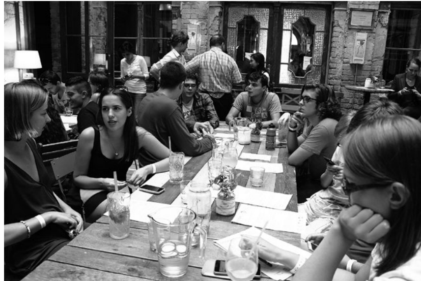
Congress of Young Europeans in Budapest