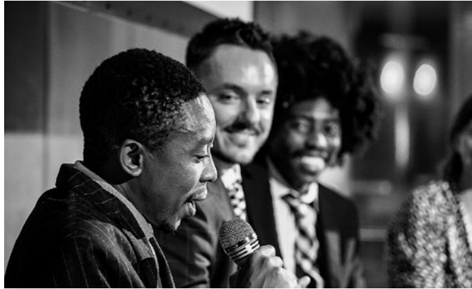
“Zambezi News” live in Berlin: the satirical news show provides trenchant send-ups of politics and everyday life in Zimbabwe.

Art too can be an instrument of civic education. Art sharpens our perceptions, trains our sense of intuition, and inspires us to creative action. The spread of digital technology generates entirely new possibilities for artists: it dramatically expands opportunities to participate in cultural activities and achievements and in this way opens up new spaces for social and political intervention.