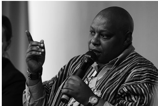
Maina Kiai at the conference "Accountability Now!"

Supporting and advancing democracy and democratization worldwide is one of the core priorities of the Heinrich Böll Foundation's international work. Universal human rights – from freedom of expression to the elimination of all forms of discrimination against women – are both the wellspring and linchpin of democracy. Together with our partners, we also work to advance legislative initiatives around the world that aim to protect the human rights of lesbian, gay, bisexual, trans* and inter* (LGBTI) individuals. Vibrant societies need forces that promote and nurture a free political culture. To this end, we support the work of civil society organizations, journalists, and the media. We also work with our partners to resolve conflicts, to find constructive paths for the settlement of disputes, and to achieve a balance of interests – all crucial factors in preventing the erosion or even collapse of democratic practices.