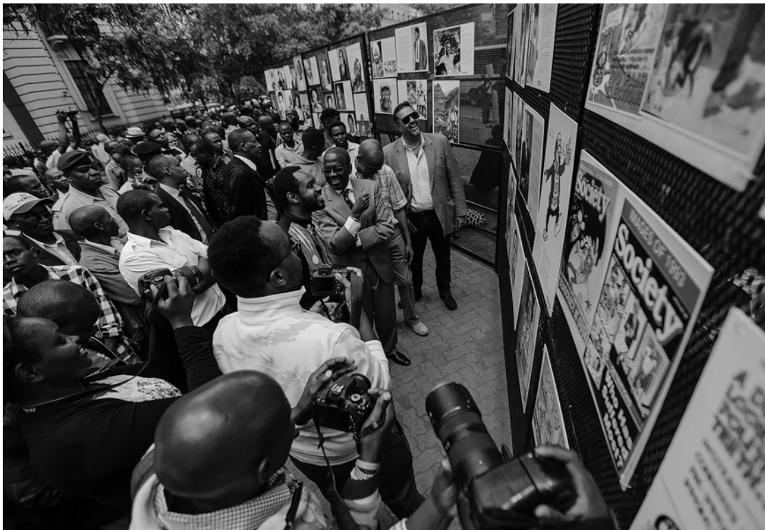
“Courage” – an exhibition in Nairobi tells the story of Kenyan heroes.